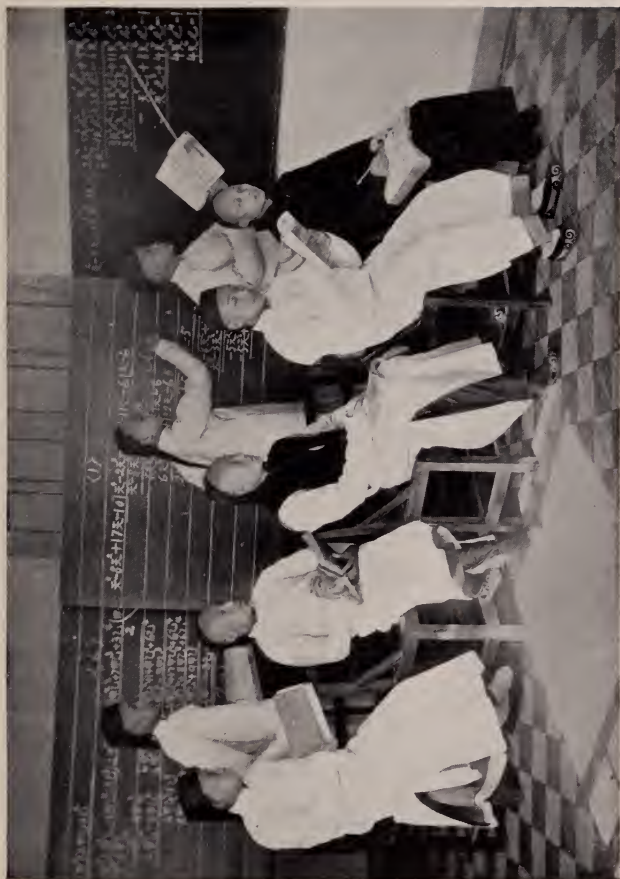
A CHINESE ALGEBRA CLASS.